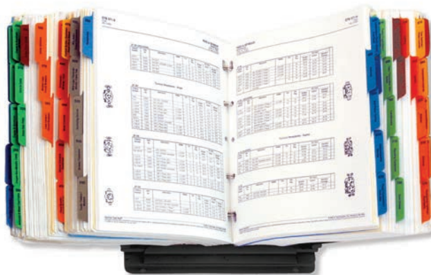
Electrical Trade Book