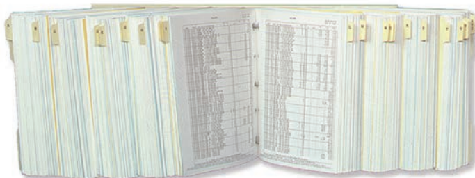
Electrical Supplies Price Directory