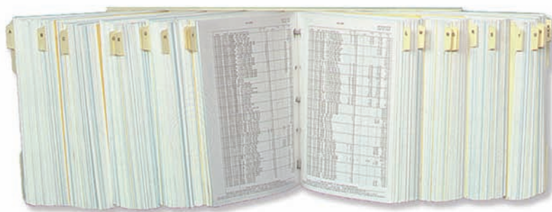
Electrical Supplies Price Directory