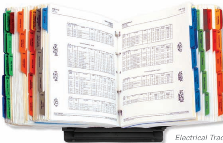
Electrical Trade Book